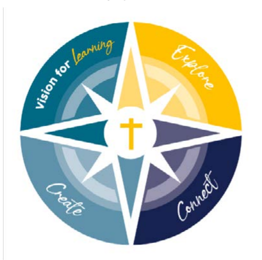
Figure 3: Emmanuel Catholic College Educational Philosophy

Developed by staff at Emmanuel Catholic College, https://www.emmanuel.wa.edu.au/vision-for-learning-2/ , 2022.