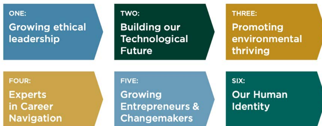
Figure 5: Archetypes

From FutureSchool by V. Hannon and J. Temperley (p. 69), 2022, Routledge. Reprinted with permission.