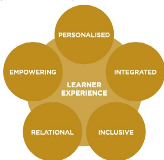
Figure 4: Learner Experience