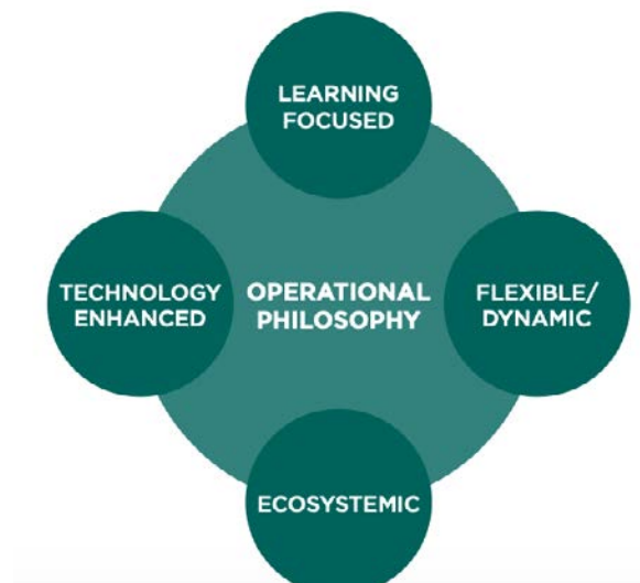
Figure 1: Values